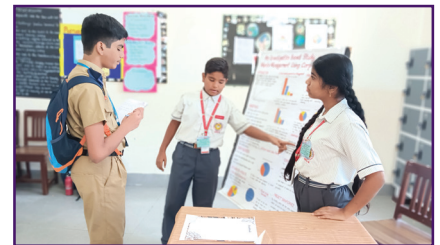
Regional Science Exhibition