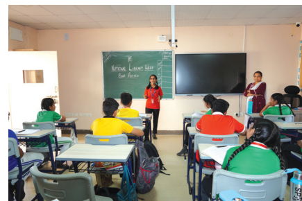
Books are Windows to Adventure-Let's Review our Favourites

( Drop Everything And Read) program was conducted in all classes to foster and kindle the reading habit.