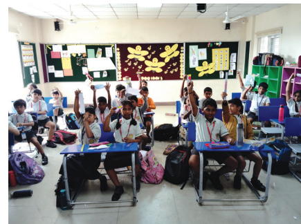
Quiz Mode Activated