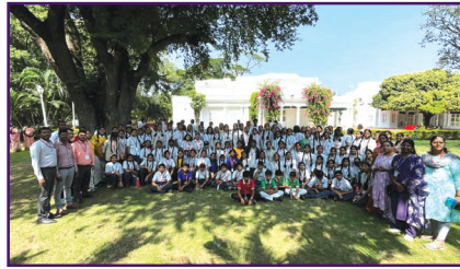
Field Trip - Rashtrapati Nilayam