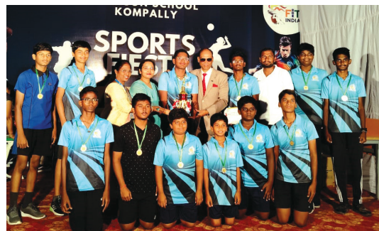
The Winning Team of JHPS-R in Volleyball