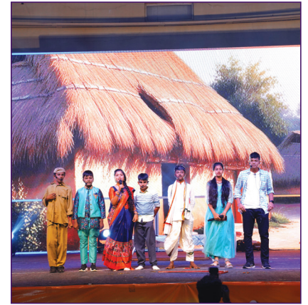
Hindi Skit-An Padoki Gali