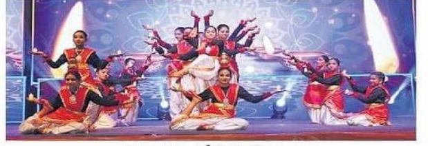
విద్యార్థులు చేస్తున్న నృత్యాలు