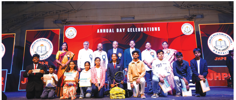
Winners all the way