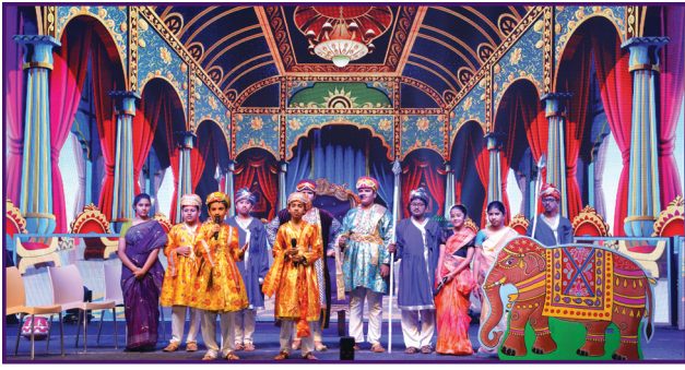
Akbar-Birbal – A Tale of Wit & Wisdom