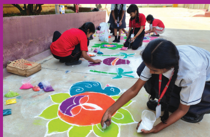
A Stroke Here, A Stroke There –The Story of Our Rangoli's Journey.

The Krishna House secured I position. The Godavari House secured II position The Cauvery house secured III position