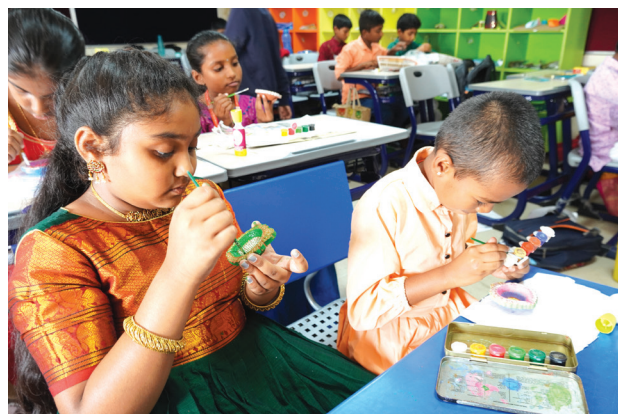
Shine Bright, Sparkle More

This initiative not only allowed students to explore their artistic talents but also deepened their connection with age-old traditions that symbolize the triumph of light over darkness and good over evil.