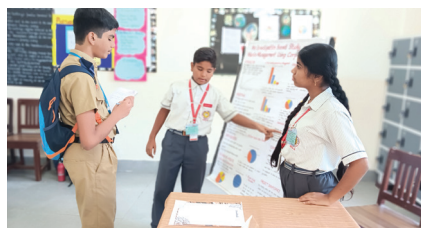
Innovating for the Future Green Technology and Sustainable Solutions