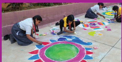
Unwind, Create, and Inspire— Students Ready for the Rangoli Challenge