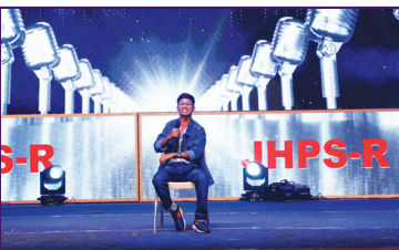
Entertainers of JHPS