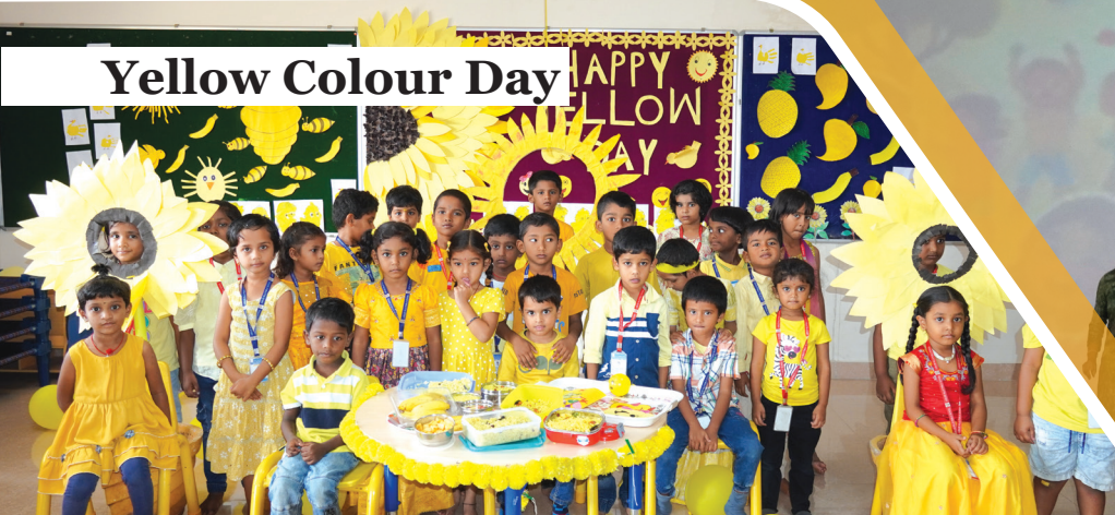
Yellow Colour Day