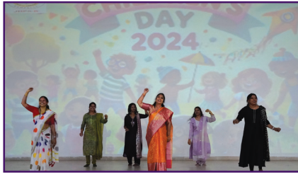
World Children's Day