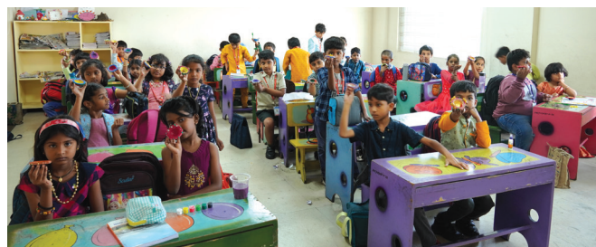
Embracing the Joy of Diwali

To explore the students imagination, creativity and celebrate the festival of lights in its true spirit, Diya Decoration activity was held as a part of Co-Curricular Activity. The students displayed their creativity by beautifully colouring and decorating the Diyas.