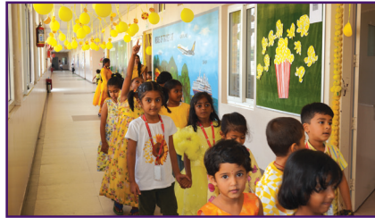
Yellow Colour Day