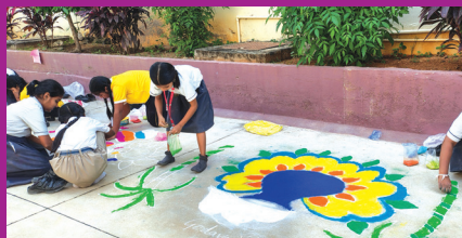
Frames of Traditions, Stories in Colours. The Rangoli Challenge is on.