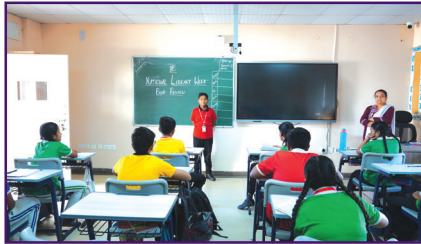
National Library Week