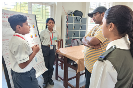
Bridging Nature and Technology How Science Shapes Our World