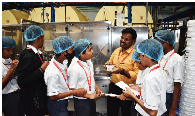
Exploring the Ghee Making