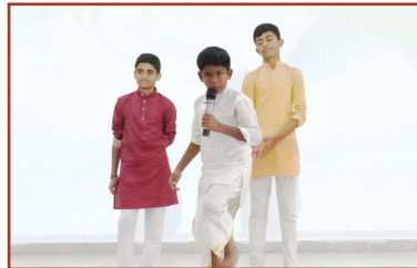
Telugu Bhasha Dinotsavam