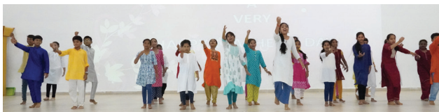
An Extravagant Tribute to the Teachers of JHPS-R

Overall, the celebration was a heartfelt tribute to the educators who inspire and nurture the future leaders of tomorrow.