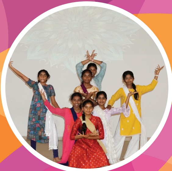
Teachers' Day Celebrations