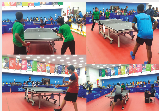
Our Students at the CBSE Clusters