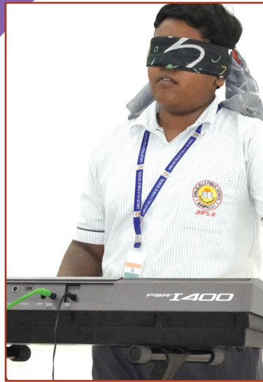
Teachers' day Celebrations