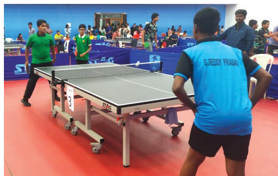
CBSE Cluster Table Tennis Championship