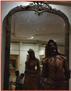
Field Trip - Salar Jung Museum