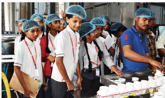
Inquisitiveness for Packing