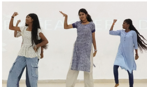
An Energetic Performance