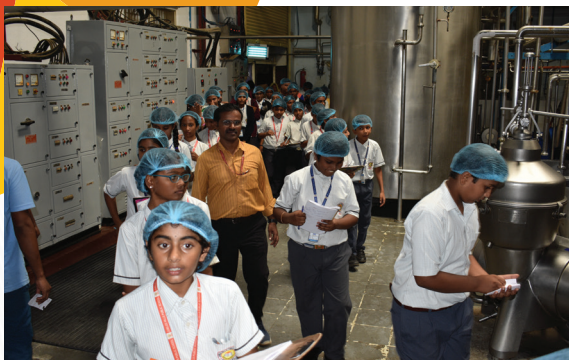
Field Trip - Masqati Ice Cream factory