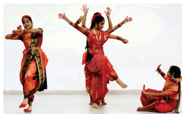
A Classical – Ode to Ganesha