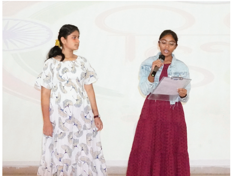
Hindi Desh Ke Niwasi Hai Hum

The event's highlights included an active participation from students across grade 6 and above, fostering a sense of enthusiasm and unity. It provided a platform for students to express themselves in Hindi, emphasizing its importance.