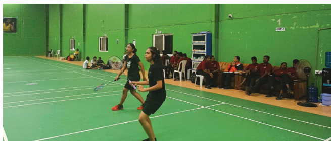
Young Players on to go