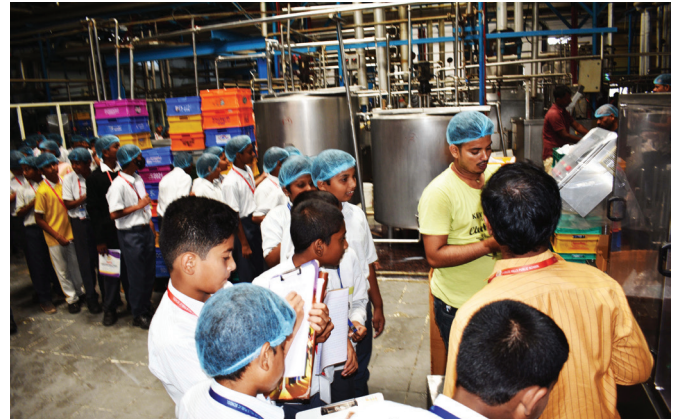
Scream for the Ice Cream

This experiential learning not only deepened their knowledge of food sciences but also sparked enthusiasm for STEM subjects. By witnessing the practical applications of their studies, students gained a clearer perspective on how theoretical concepts translate into everyday products. Such educational trips enhance subject enrichment and inspire future academic and career interests