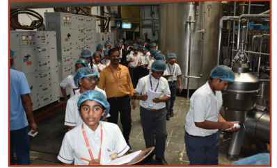
Field Trip - Masqati Ice Cream factory