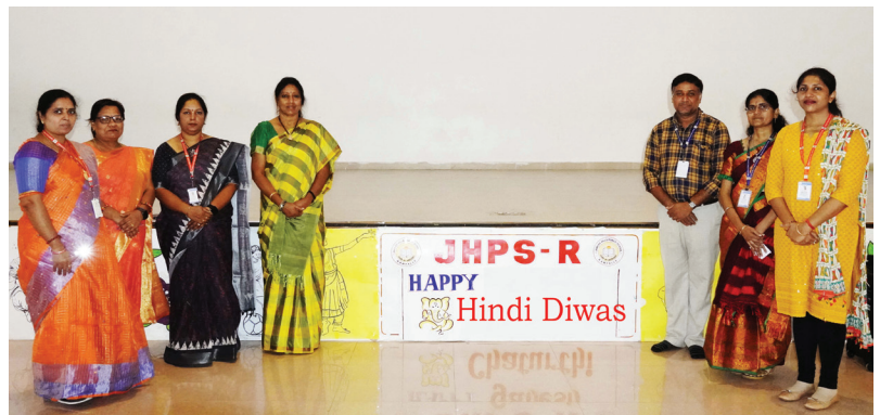
Our Hindi Mentors