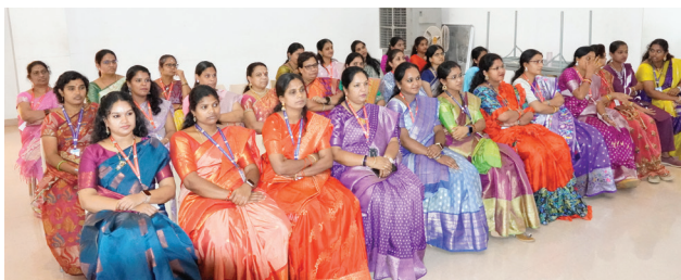
Gurus of JHPS-R