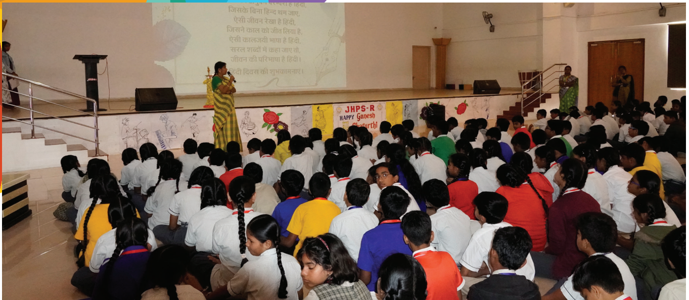
Impressing the Importance of Our Official Language