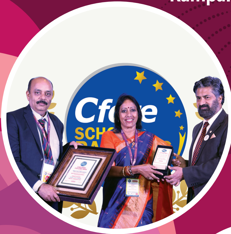
CFORE School Excellence Award 2024