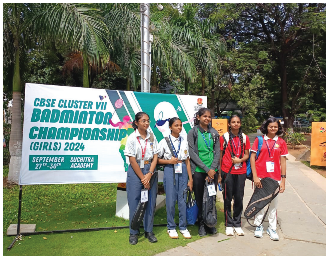
CBSE - Cluster Badminton Team

Keep aiming high, support one another, and enjoy every moment of your sporting experiences.