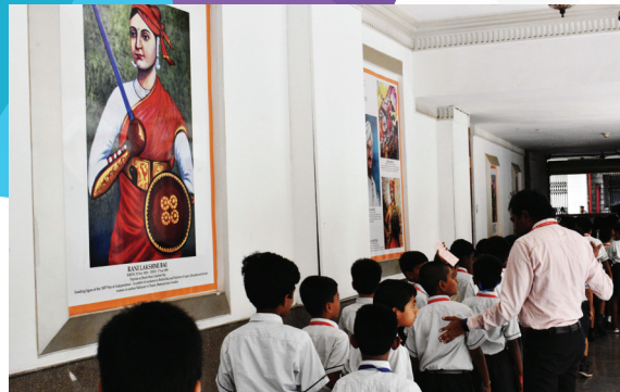
Field Trip - Salarjung Museum