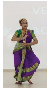
Guru Devo Bhava