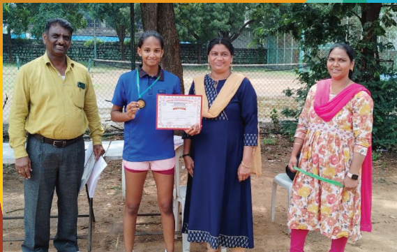
SGF Lawn Tennis Championship