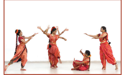
Ganesh Chaturthi Celebrations