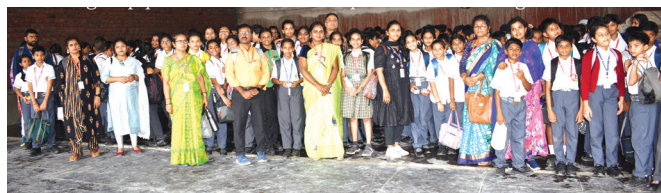
At the Salarjung