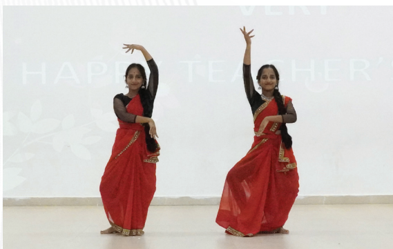
Teachers' Day Celebrations