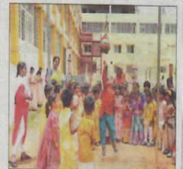
రాంపల్లిలోని జూబ్లీహిల్స్ పబ్లిక్ స్కూల్ రాంపల్లిలో విద్యార్థులు