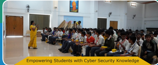
Empowering Students with Cyber Security Knowledge