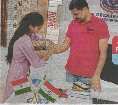
Jubilee Hills Public School Rampally