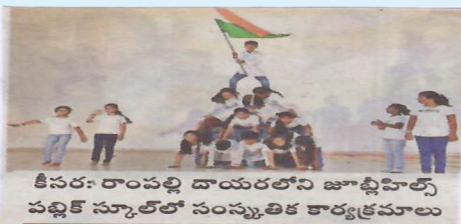
కీసర: రాంపల్లి దాయరలోని జూబ్లీహిల్స్ పబ్లిక్ స్కూల్లో సంస్కృతిక కార్యక్రమాలు