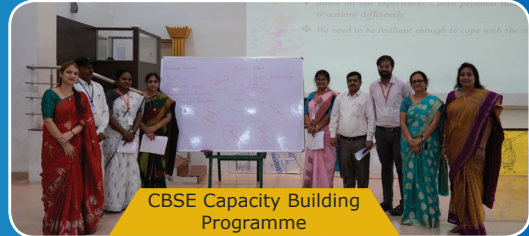
CBSE Capacity Building Programme