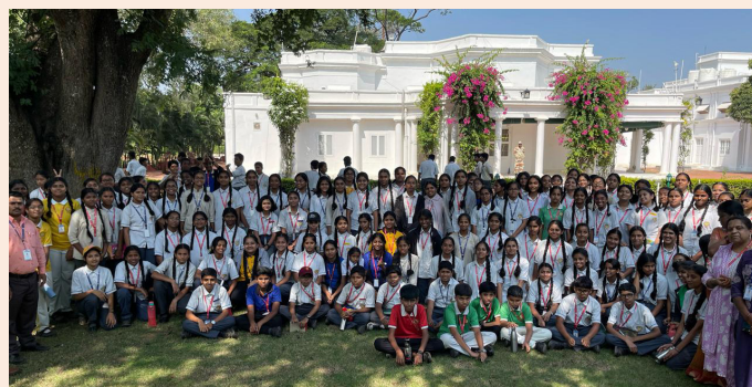
At The Rashtrapathi Nilayam