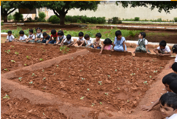
The Young and Tender Spinach Leaves

providing fresh, nutritious food. The farm is an abode to a variety of fruits and vegetables which include mango, guava, passion fruit, papaya, brinjal, potato, tomato, lady's finger, ivy gourd, leafy vegetables like spinach, amaranthus, fragrant and beautiful flowers—rose, lily, hibiscus, chrysanthemum, etc.