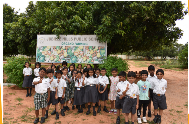
Organic Farm at JHPS-R