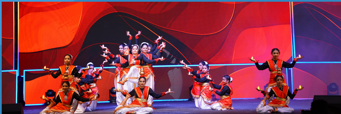
An Ode to the Divine