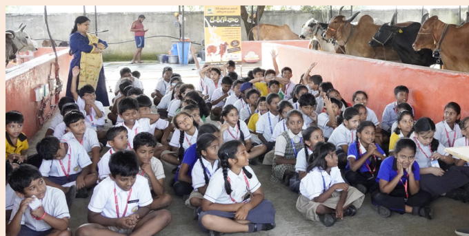
Cows - Our Responsibility

Jubilee Hills Public School, Rampally enriched students' experience with memorable field trips. During the academic year, the students embarked on exciting field trips to the renowned Masqati Ice Cream Factory located in Turkayamjal, the Salar Jung Museum, Wake-Up Farm and Goshala, where they learned about nature, farming, and animal care and organic farming. They went on a memorable visit to the Rashtrapathi Nilayam, to explore its historical background, thematic gardens, and architectural marvels, enclaves dedicated to unsung heroes of Independence and chapters of Hyderabad history, replica of the historic flag post.