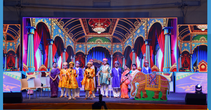
Akbar-Birbal – A Tale Of Wit&Wisdom