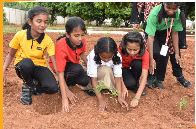
Students Enjoying in Planting the Trees